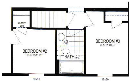
OPTIONAL BASEMENT STAIRWELL

NOTE: HUD HOMES THAT HAVE A GAS WATER HEATER AND A 5/12 ROOF PITCH WILL REQUIRE AN "SC" ON SITE INSPECTION